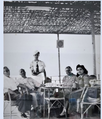
A Group Under the Canopy

with beverages including espresso, and other seasonal refreshments.