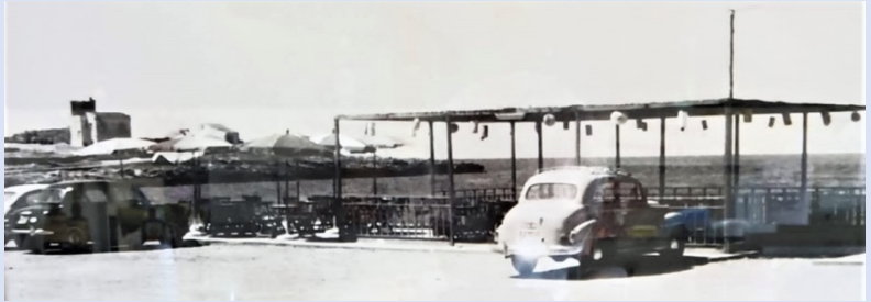
Parking Area with Refreshment Area Under the Canopy & Umbrellas

The Piazza di Pittsburg has not always been part of the Isola delle Femmine landscape. Located directly in front of the City Hall of “Commune di Isola delle Femmine” on the street named Via Lungomare Eufemio, in 1950s and 1960s, the area was used as a parking lot that could fit about 5 automobiles. It also had a small cement slab enclosed by an iron railing and partly covered with a canopy. The canopy area was filled with tables and chairs and there were a few tables with umbrellas beyond the canopy. This area was used in the summer for outdoor dining and small gatherings such as birthday parties and Holy Communion celebrations. The area would be dismantled in the winter.