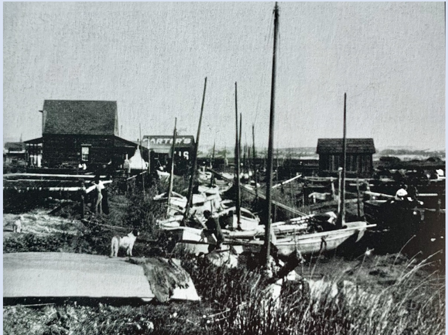
Alhambra Creek, Home to Many of the Martinez Fishing Fleet.

Not unlike Pittsburg, Martinez sits on the shores of the Sacramento Delta, which at one time flourished with fish. Salmon and shad were among the primary harvest. In the late 1800's, Martinez also developed an Italian fishing village along the shoreline area in close proximity to Alhambra Creek and adjacent to Granger's Wharf. A large influx of immigrants arrived from Isola delle Femmine as well as from the neighboring villages of Saint Elia, San Vito Lo Capo, Cattolica and Sferacavallo. The men, of course, would arrive first from the Old Country. Many stayed in the "arcs" or small houseboats as we call them today. Many others stayed in the boarding houses which later became central to leisure activities. They would secure work, acquire a residence or property of their own and save up to