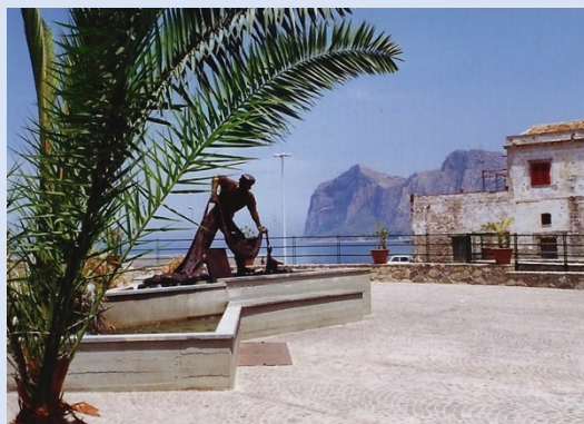
Piazza di Pittsburg Today

Eventually, as traffic in the street separating the bar from the seating area increased, this gathering area with service was abandoned due to safety concerns for the waiters. In the 1970s, the city started improving the area expanding it towards the marina, turning it into a more proper piazza.