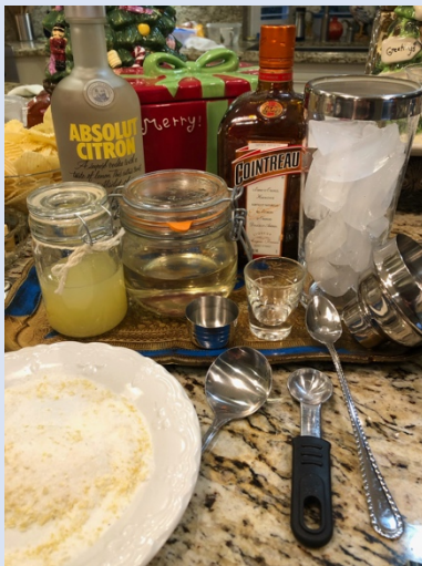
Lemon Drop Drink Ingredients