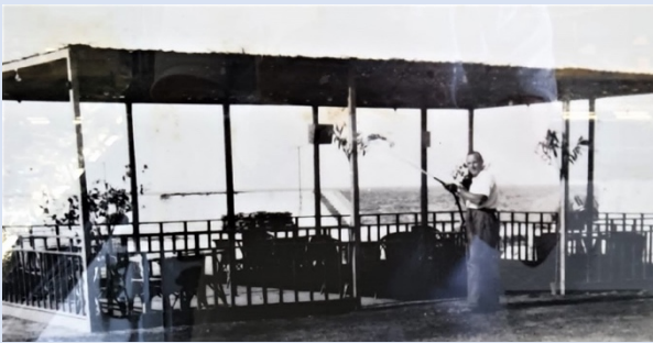
Closeup of the Refreshment Area

Under the canopy there was an intercom connected to the café shop across the street, named the Lo Bianco Bar. With the intercom, patrons could order food or drink, which would be delivered to the table area by the waiter. One had to be at least 18 years old to order unless accompanied by an adult or older family members. Available from the Lo Bianco Bar were cakes and pastries such as cuccidati , arancini , cannoli , sfingi San Giuseppe along