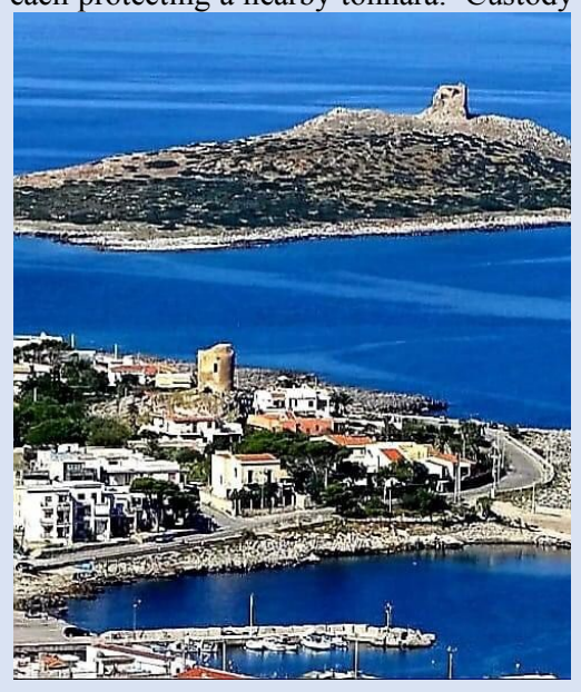
The Towers of Isola delle Femmine The upper on the Islet of the same name. The lower in the city itself. Isola's harbor at the very bottom of photo

By the beginning of the 19<sup>th</sup> century, the strategic importance of the towers began to decline, both because the barbarian incursions were finally ending, and because the centuries-old function of warning through the lighting of the lighthouse gave way to the advent of modern telegraphic signals. The towers were slowly abandoned and largely left to decay fighting alone for survival against the wear and tear of time and the destructive work of man.