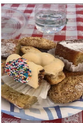
Desserts at our Old Fashioned Picnic