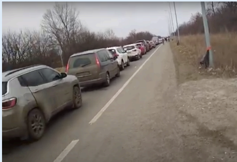
Cars in Line to Enter Romania