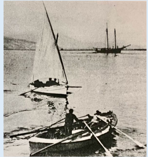
A Felucca Sailboat Comes into North Beach Under Sail & Oars While a Delta Sailboat Is Rowed Out. A schooner Sits in the far background

The first fishing boats that were used by Italian fisherman in the mid to late 19 th century were called feluccas, lateen rigged vessels, the type of which had been used in the Mediterranean Sea for centuries and which had its origin in Egypt. The lateen sail was triangular in shape extended by a long spar slung to a low mast. The feluccas were a common sight in San Francisco Bay and in the fishing grounds south of the Golden Gate between Pigeon Point and Monterey until after the turn of the century when they were replaced by gasoline powered craft. While the felucca was an ideal fishing boat for bay and ocean fishing, its design made it unsatisfactory for work in the waters of the Sacramento Delta.