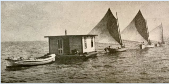
Delta Sailboats with Their Sprit Rigged Sails

In 1868 a new style of boat appeared in the Sacramento Delta, equipped with a sprit rigged sail. It measured about 26 feet in length with an eight-foot beam or width. It had a retractable keel which allowed it to enter very shallow water, and a removable rudder which permitted the net to be hauled over the stem.