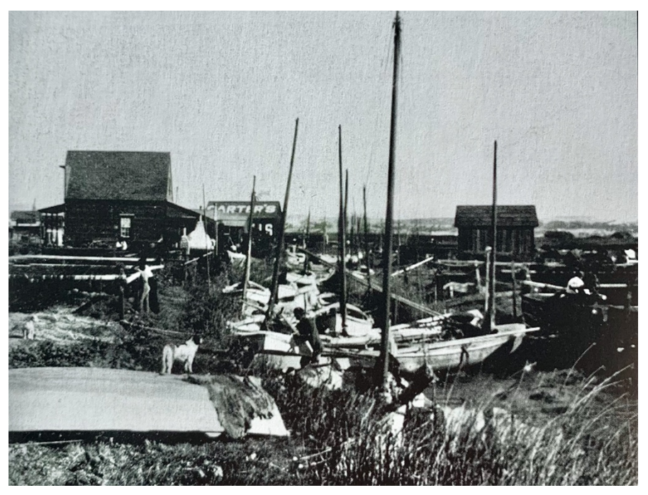
Alhambra Creek, Home to Many of the Martinez Fishing Fleet.

Not unlike Pittsburg, Martinez sits on the shores of the Sacramento Delta, which at one time flourished with fish. Salmon and shad were among the primary harvest. In the late 1800's, Martinez also developed an Italian fishing village along the shoreline area in close proximity to Alhambra Creek and adjacent to Granger's Wharf. Α large influx of immigrants arrived from Isola delle Femmine as well as from the neighboring villages of Saint Elia, San Vito Lo Capo, Cattolica and Sferacavallo. The men, of course, would arrive first from the Old Country. Manv stayed in the "arcs" or small houseboats as we call them today. Many others stayed in the boarding houses which later became central to leisure activities. They would